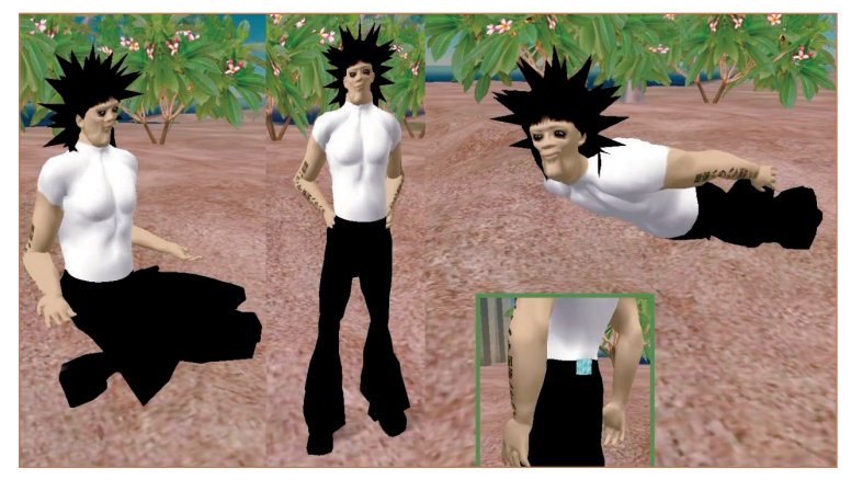
Figure 3. Second Life integration with the physical world. Accelerometer data is collected from a person's mobile phone and classified into the activity states of sitting, standing, or running. These states are then injected into Second Life via the mobile phone object the avatar carries (inset). Second Life users define the profile for their avatar to interpret and render these incoming activity states. For example, in the figure, the user has mapped sitting, standing, and running to yoga-floating, standing, and flying, respectively.

BikeNet is a recreational application that contains elements of personal, social, and public sensing. There's substantial interest in the mainstream recreational cycling community in collecting data quantifying various aspects of the cycling experience, mirroring the broader interest in fitness metrics among exercise enthusiasts and other health-conscious individuals. Existing commercial bike-sensing systems targeting this demographic measure and display simple