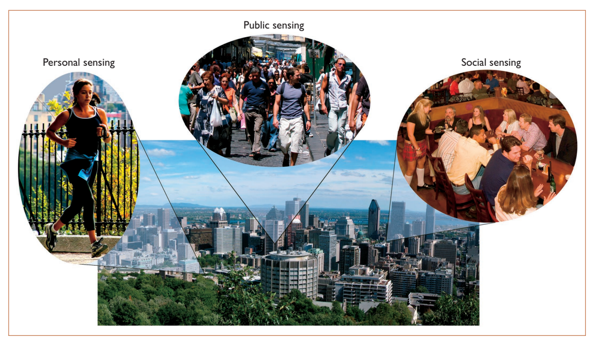
Figure 1. People-centric sensing applications can be thought of as having a personal, social, or public focus.

become the focal point of sensing and the visualization of sensor-based information is for the benefit of common citizens and their friends, rather than domain scientists or plant engineers. Additionally, the users' aggregate mobility both enables sensing coverage of large public spaces over time and lets individuals, as sensing device custodians, collect targeted information about their daily patterns and interactions. The sensing coverage of spaces, events, and human interactions is opportunistic in a people-centric system because the system architecture has no point of control over the human mobility patterns and actions that facilitate this coverage. Although this lack of control can translate into gaps in sensing coverage, the alternative of a world-wide web of static sensors is clearly untenable in terms of monetary cost, scalability, or management. Furthermore, by having people carry the sensing devices in their mobile phones, iPods, and so forth, a people-centric sensing system creates a symbiotic relationship between itself and the communities and individuals it serves.