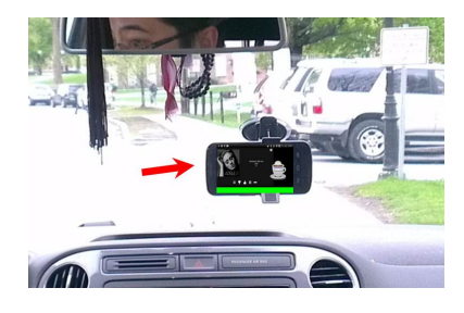
Figure 1: CarSafe application is running on a smartphone (indicated by the red arrow) mounted on the windshield of an automobile.

Copyright is held by the author/owner(s). UbiComp12, September 5-8, 2012, Pittsburgh, USA. ACM 978-1-4503-1224-0/12/09.